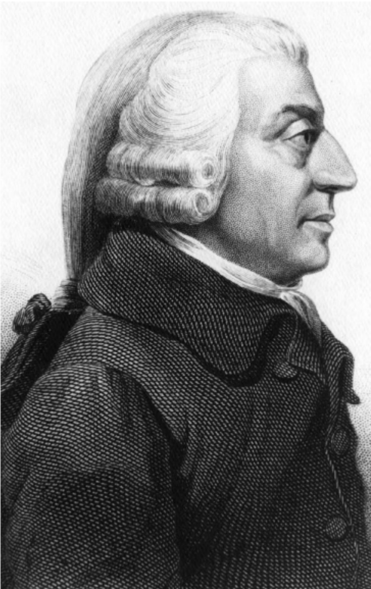
An etching of Adam Smith

When the Scotsman Adam Smith (1723–1790) was born, industrialization and a profit-driven market system were replacing custom and command-driven economic systems across Europe. These changes reflected an intellectual shift toward rationality, progress, liberty, and secularism — generally referred to as the Enlightenment.