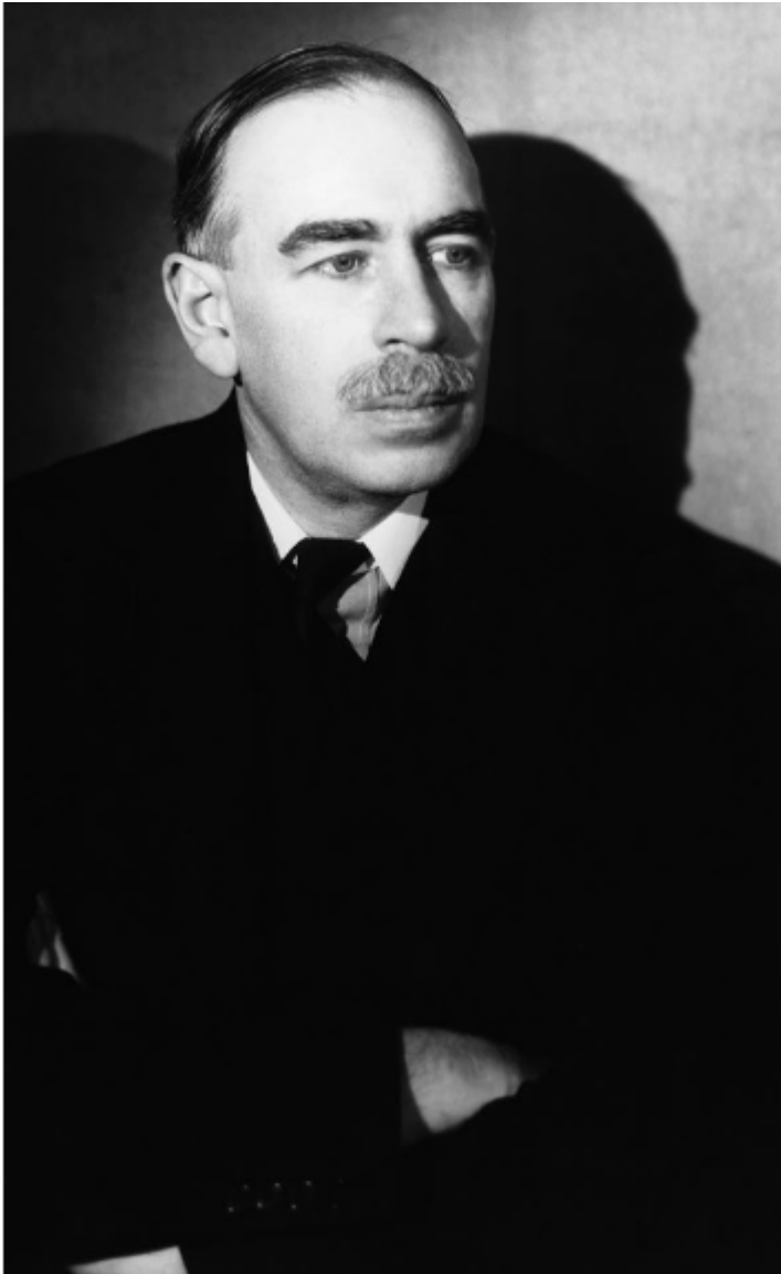
John Maynard Keynes, 1940

John Maynard Keynes (1883–1946, last name rhymes with “rains”) was born into an educated family. During his life, he worked in academia, economic publishing, private financial advising and management, currency speculation, and as an official in the British Treasury.