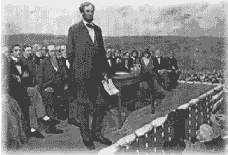
Lincoln at Gettysburg

Abraham Lincoln is regarded by most authorities as America's greatest president, despite the fact that many others in that office had superior education and experience. His greatest contribution lay in preserving the Union. Perhaps the most eloquent expression of his conviction regarding this was his given on November 19, 1863 at the battlefield, where many thousands of Union and Confederate soldiers had lost their lives.